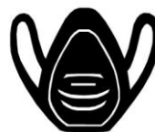
Protective Clothing Pictograms